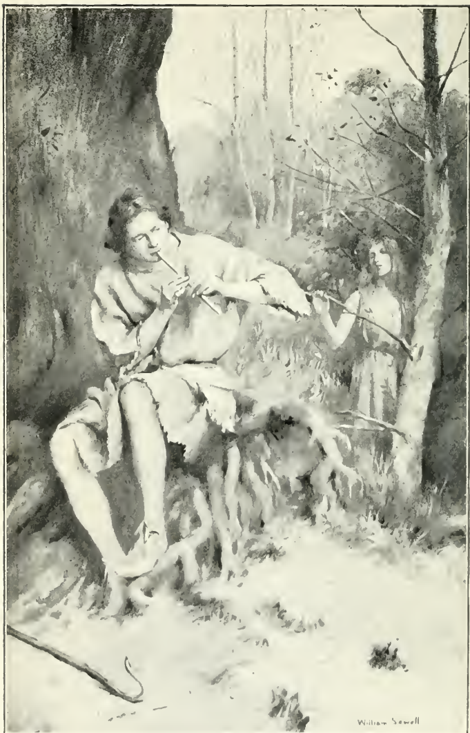
Peridore . . . wooed her with his pipe to draw near . . . —p. 84.